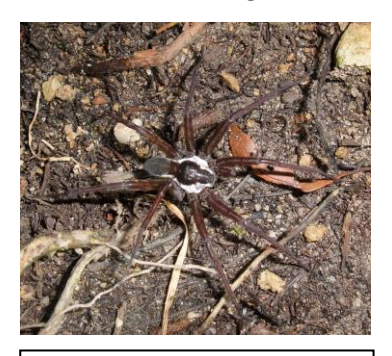
Photo1: Dolomedes briangreenei male has bright white bands of hairs on its sides, which is different to the females, that have narrow lateral bands.