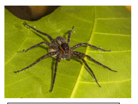
Dolomedes briangreenei female with eggsac between her fangs.

What makes fishing spiders so special is their semi-aquatic hunting style.