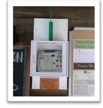
Photos 2 and 3: the AED in situ on the wall of The Shop (near the main door)