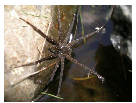
Dolomedes briangreenei Raven & Hebron 2018 female waiting for prey