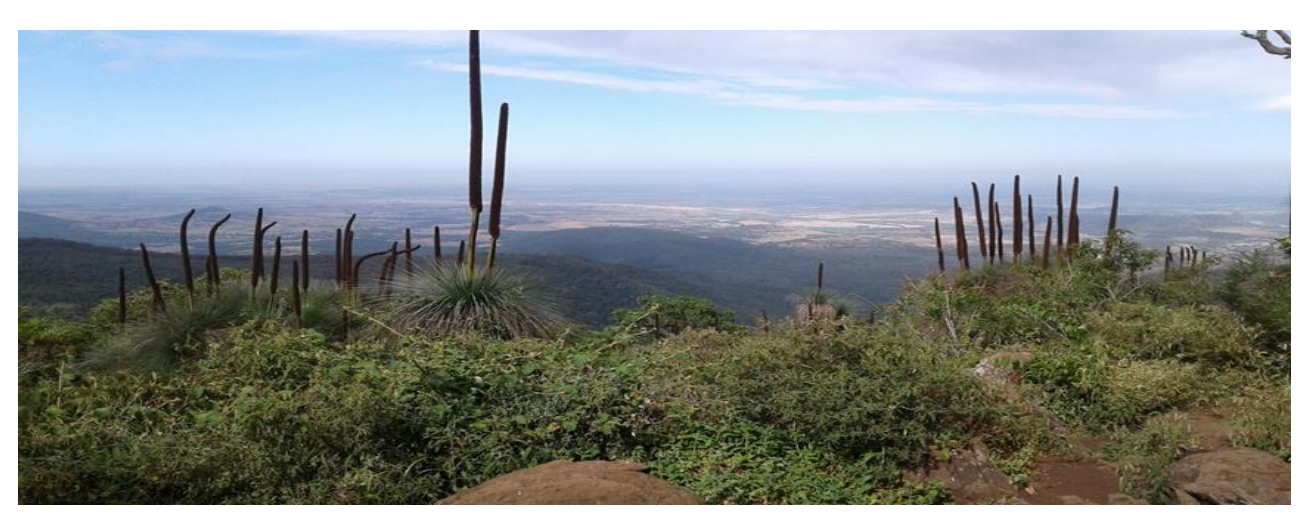
Welcome to BMCAI Newsletter-Issue 3

G rab a drink, find a spot in the sun and enjoy the read. The Newsletters are issued quarterly, following each meeting of the Bunya Mountains Community Association Inc (BMCAI). This issue covers the period May, June and July 2019.