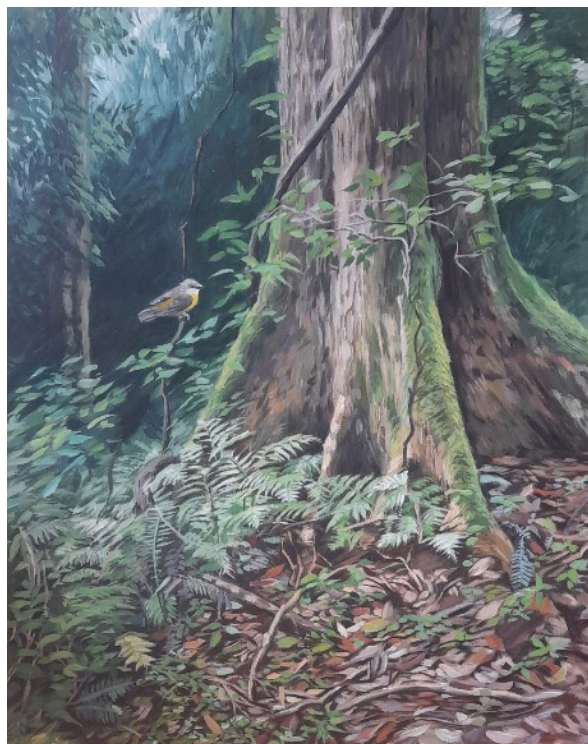
(Right) Yellow Robin - Raffle Prize