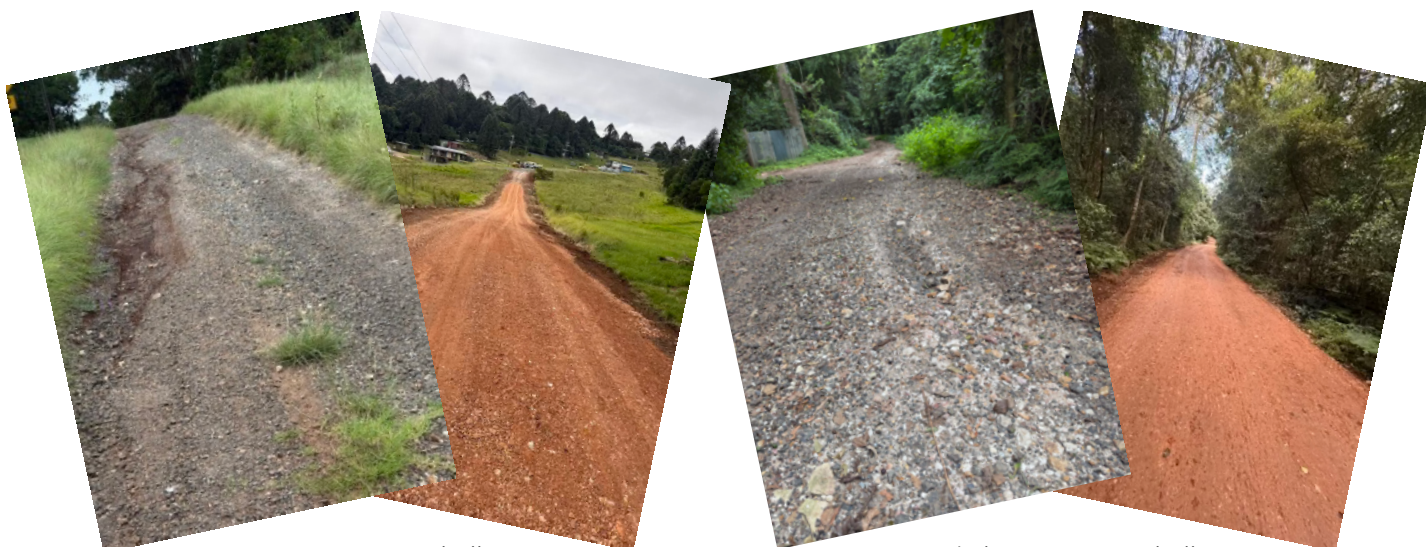
Ensor Street, Mowbullan. Before and After.