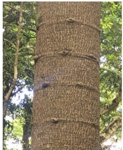
Pic 4. Trunk of a mature Bunya tree showing branch excision and evidence of embedded 'Bunya Knots'.