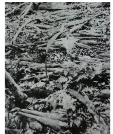
Pic 2. 'Bunya Candles' from 'Bonyi-Bonyi' page 98.