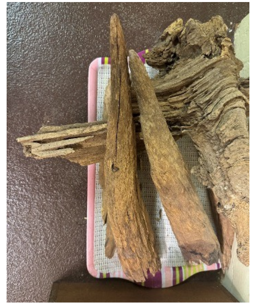
Pic 1. 'Bunya Horns' displayed at Cedarvale Museum

In his iconic 'Bonyi-Bonyi' book, Ray Humphrys describes the story of a group of young people who attended a Lutheran camp at the Bunya Mountains back in 1915. On setting up the camp "two men emerged from the rainforest with a bag full of wood known to the mountain dwellers as 'Bunya Candles'. There is something peculiar about these. Dry wood is rather scarce; it is often difficult to get suitable wood to keep the campfire burning. These "Bunya Candles" are the remains of the top part of the trunk of a bunya pine tree. The log and branches of the tree once having rotted away, leave knotty butts of the branches which were embedded in the trunk, as sound as ever. This contains a quantity of resin and tarry matter which will burn, wet or dry. Visitors to the mountain are invited to look for these "Bunya Candles". They do not need chopping fine and are easily gathered and burn reasonably well" - from 'Bonyi-Bonyi', page 102 (see Pic 2)