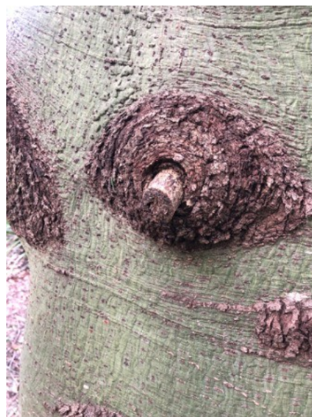
Pic 6. A branch knot from a narrow leaf bottle tree. ( Brachychiton rupestris )

The Bunya horns/candles/knots uniqueness appears to centre around a combination of its dense heartwood offering structural strength along with very high resin content, which being a complex mix of terpenoids and phenolics, offers incredible preservation characteristics along with very high flammability.