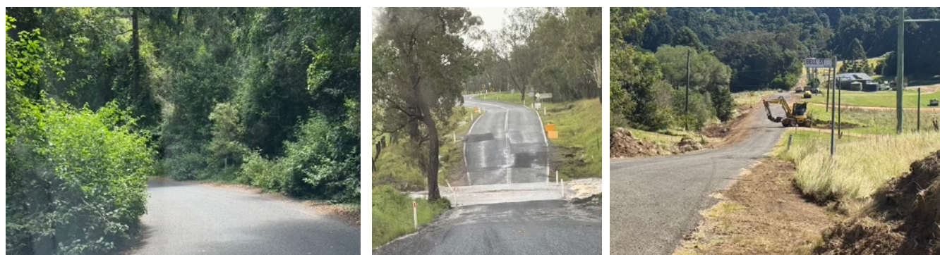
Road conditions around the Bunya Mountains.