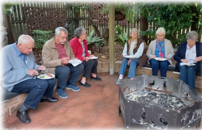
Image 6 Members enjoying dinner in Sprengers beautiful courtyard