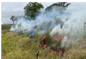
Image 11 fuel reduction burn