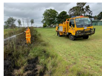
Image 10 Fuel Reduction Burn