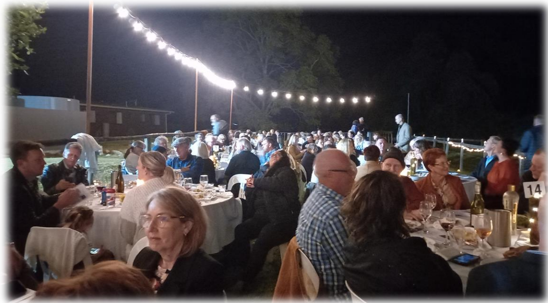
Image 1. Bunya Mountains Dinner Under the Stars 2022

Welcome to the Bunya Mountains Community Association Inc (BMCAI) Newsletter -Issue no 16, our fourth and final Newsletter for 2022. Our previous Newsletter (Issue 15) was circulated in September 2022, and a copy can be found on our website at https://bunyamcainc.wixsite.com/mysite/news . These Newsletters are produced following every BMCAI Quarterly Meeting.