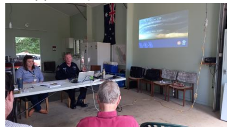
Image 8 A Minutes Silence for Armistice Day