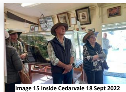
Image 15 Inside Cedarvale 18 Sept 2022