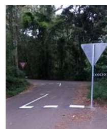
Image 4 from Bunya Ave turning left to Dalby/Nanango

I am happy to report that as I sit here writing this article, a contractor is up on the corner painting lines on the road. A crew came through last week and installed 3 Give Way signs. At long last some progress is occurring, even if it's been a very long wait ..... what do they say- patience is a virtue?