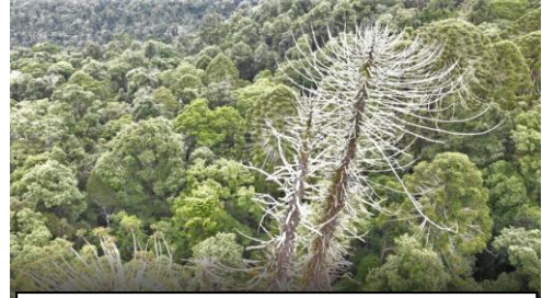
Bunya pines in the Bunya Mountains National Park are losing their leaves due to a serious soil-borne disease.

https://www.abc.net.au/news/2022-09-21/wet-conditions-make-worse-a-serious-threat-killing-bunya-trees/101460316