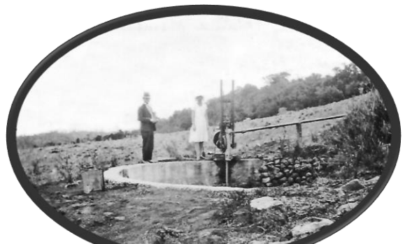
Image 14 Mowbullan Spring

After a bit of detective work we have since found out there was a spring on Mowbullan. Ninety years would have changed the surroundings quite a lot and finding it could be a bit of a expedition. So if you have some long forgotten photos of the Bunyas we would like to see them. We will scan them and return them to you.