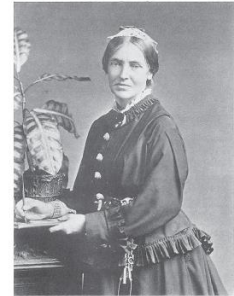
Marianne North Fig. 1. Marianne North, date not known, reproduced from the frontispiece of Some Further Recollections of a Happy Life, Selected from the Journals of Marianne North Chiefly Between the Years 1859 and 1869.

https://www.rbgsyd.nsw.gov.au/getmedia/378b1a53-f74c-44cc-b1cf-87815e345721/BGD0569_Cunninghamia-2020-DOWE-Marianne-North-paintings.pdf.aspx